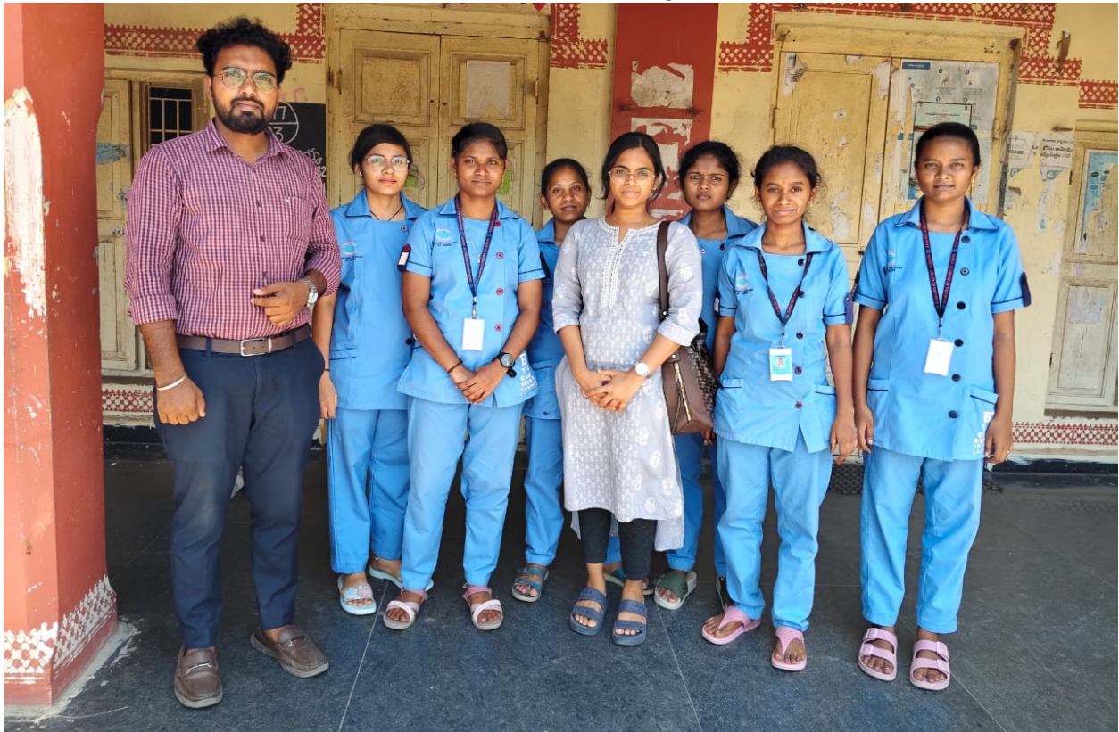
Doctors and para medical staff of Sankara Eye Hospital, Pedakakani attended the Eye Camp at Kondapaturu on 09.05.2026