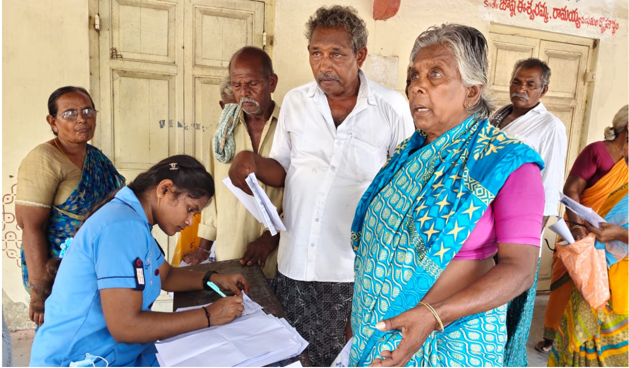
Monthly Eye Camp at Kondapaturu village held on 09.05.2026