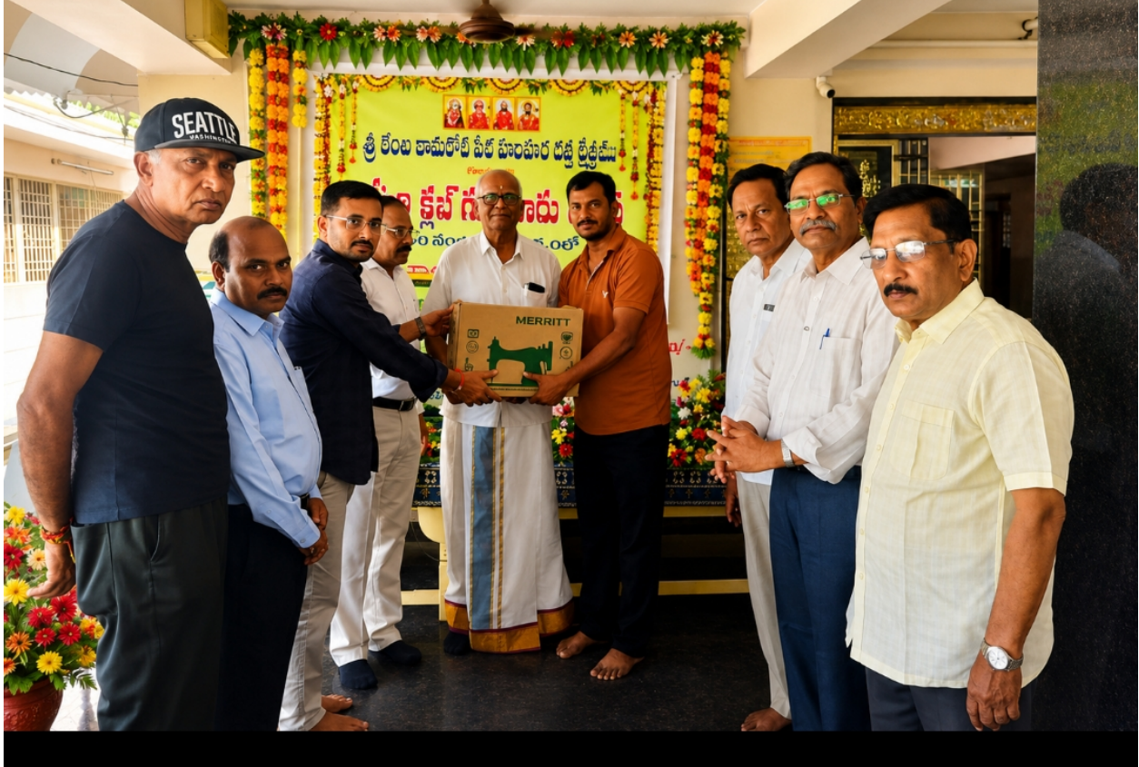
Distribution of Sewing Machine on 10 th May, 2026