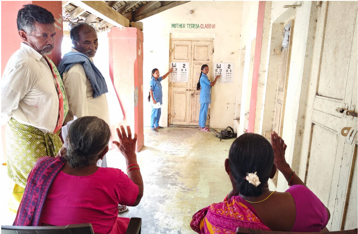
Monthly Eye Camp at Kondapaturu village held on 09.05.2026