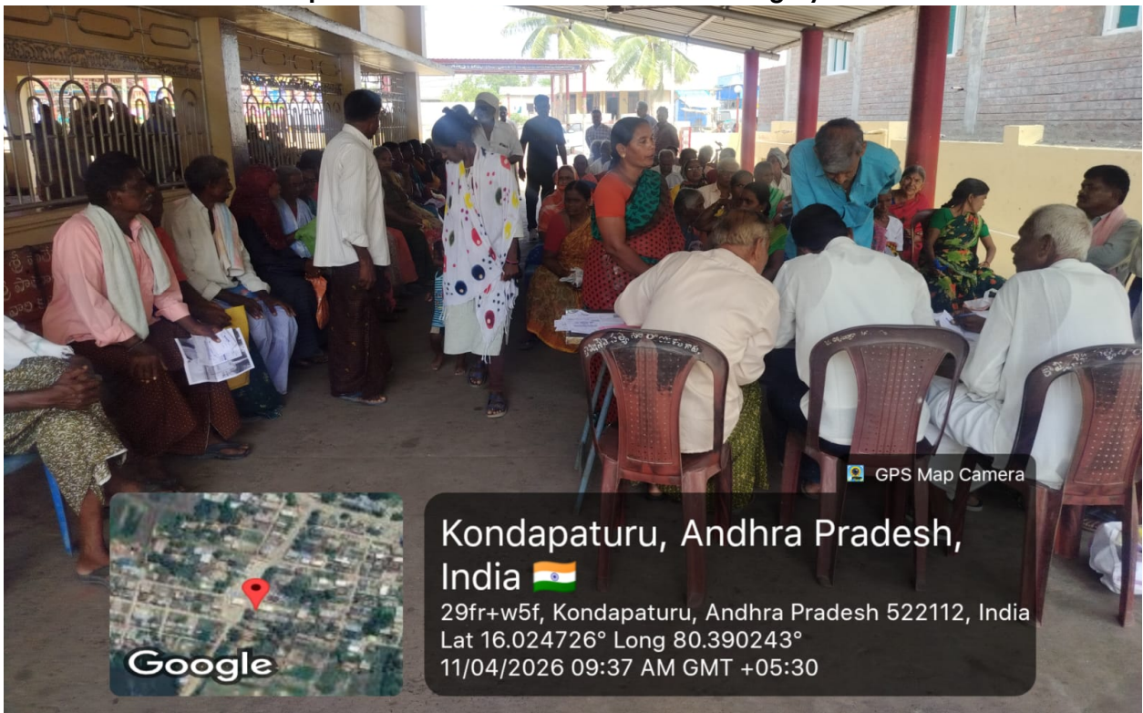
Monthly Eye Camp at Kondapaturu village held on 11.04.2026