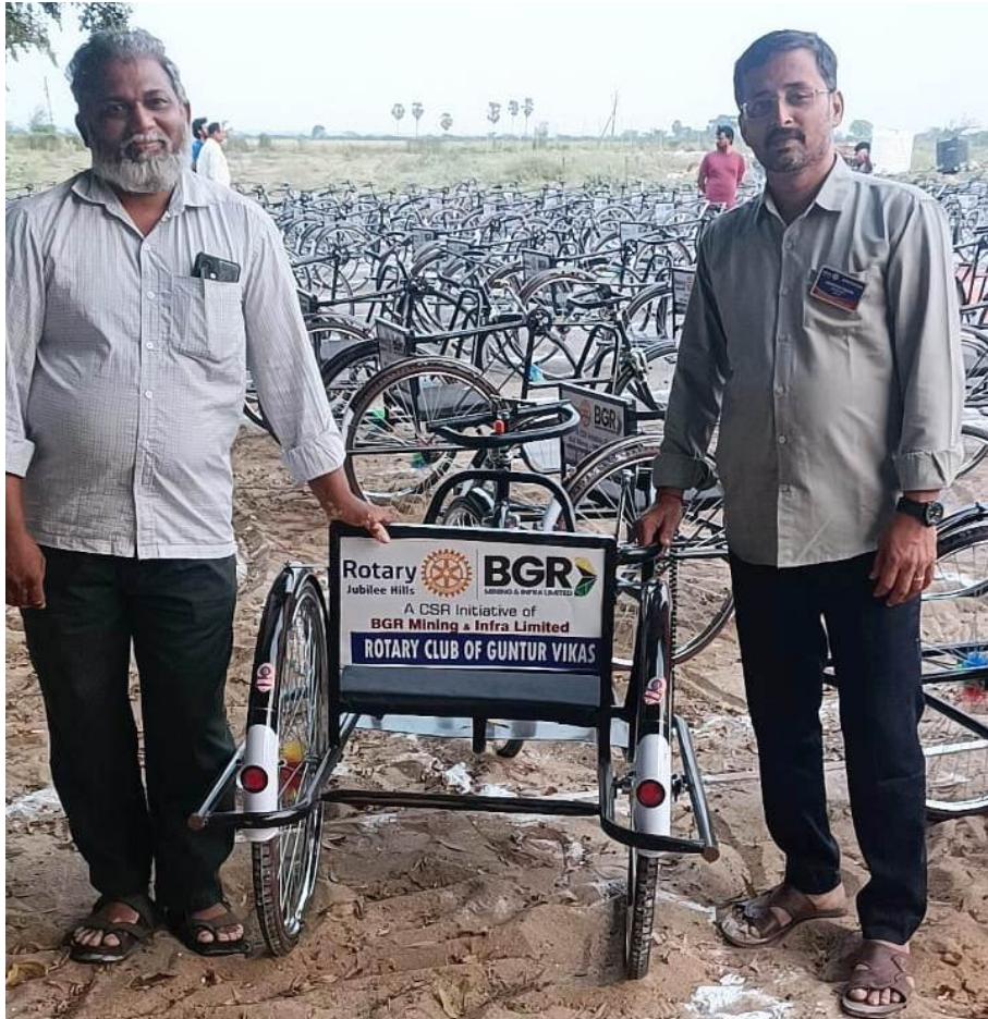
Tricycles for distribution