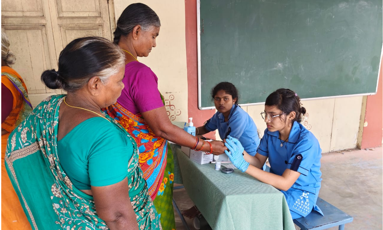
Monthly Eye Camp at Kondapaturu village held on 09.05.2026