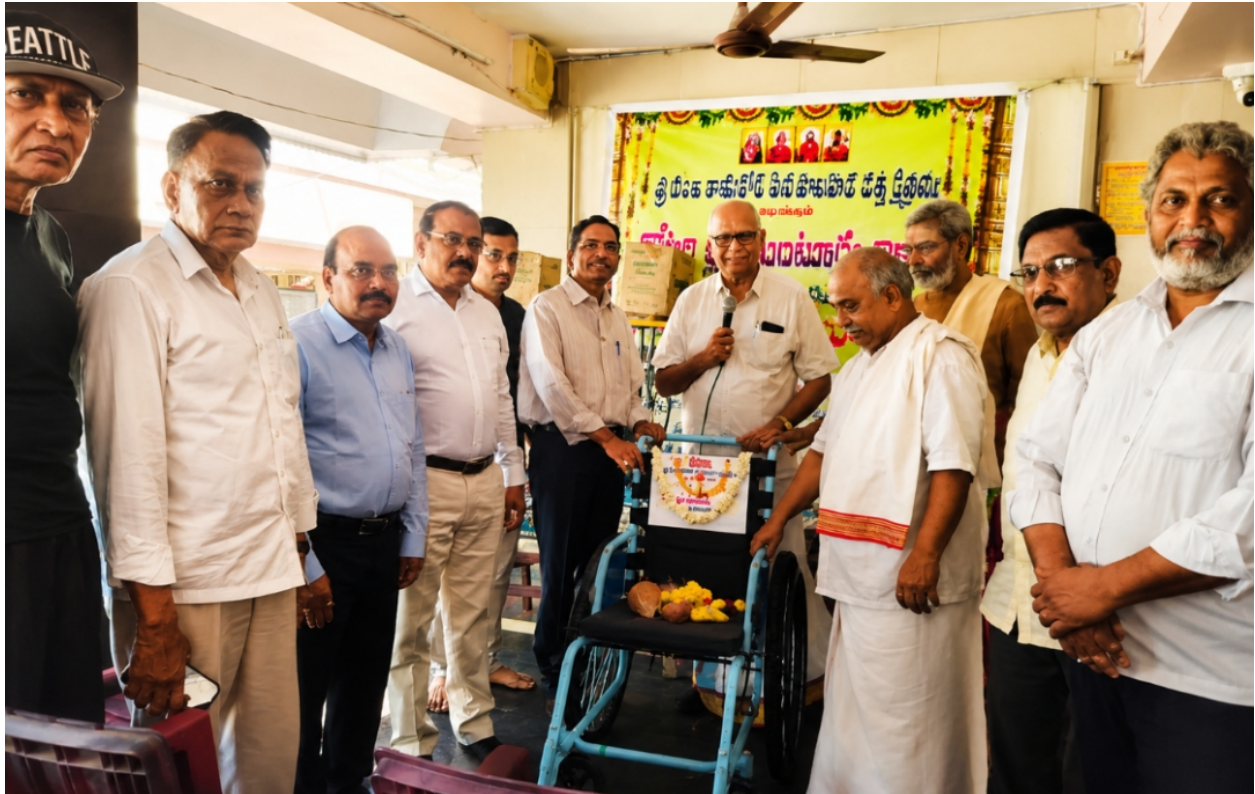
Wheel Chair Distribution to Sri Rama Sahita Satyanarayana Swamy Temple, Pattabhipuram, Guntur, for the use of disabled and old age people on 10 th May, 2026